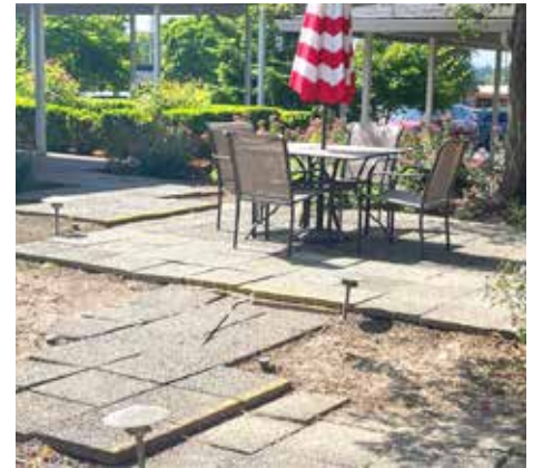
Outdoor pool patio.